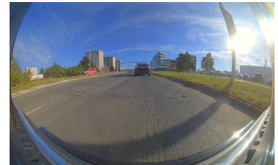
Top View cameras video extractor.